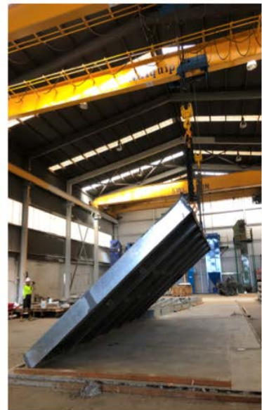
Images showing casting of lightweight slab panels to assess the manufacturing process.