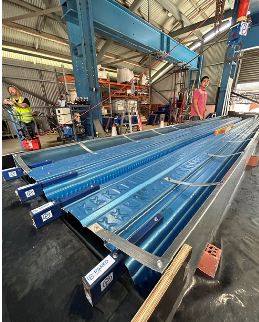
Image 1. Slab System test preparation