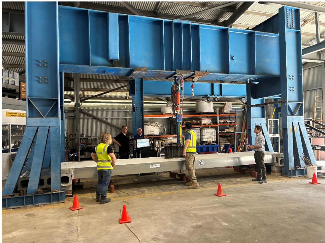
Image 3. Live Load performance testing